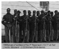
1865 portrait of soldiers of the 10th Regiment U.S.C.T. at Fort (Lynch, Maryland)

ARLINGTON NATIONAL CEMETERY HISTORY EDUCATION SERIES