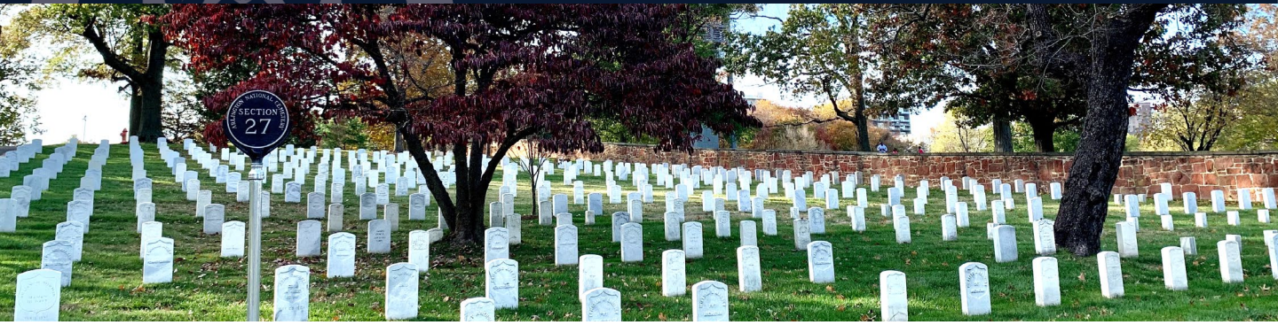
Section 27 of Arlington National Cemetery.

Many recognize Arlington National Cemetery as a military cemetery, where burial space is reserved for members of the United States military and their family. If you visit the northeastern sections of the cemetery, however, you will find a number of headstones marked “citizen” or “civilian.” These graves date to the early days of the cemetery and are the final resting place of thousands of African American “freedpeople” who died in and around Washington, D.C. from 1863 to 1867.