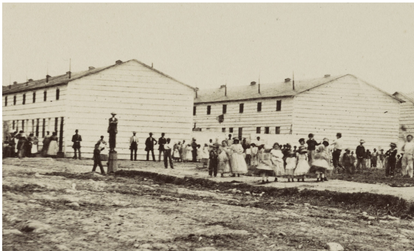
Civil War-era photo of a group of freedpeople standing in front of their barracks in Alexandria, Virginia. Records do not indicate that residents of these particular barracks were buried in Arlington National Cemetery, though many of the barracks around Washington, D.C. looked similar to the pictured buildings.

In 1863, the Freedmen's Bureau built a government farm and a "Freedman's Village" on land that was later incorporated into Arlington National Cemetery. Ironically, the residents of Freedman's Village were buried at other cemeteries and are not the freedpeople in Section 27.