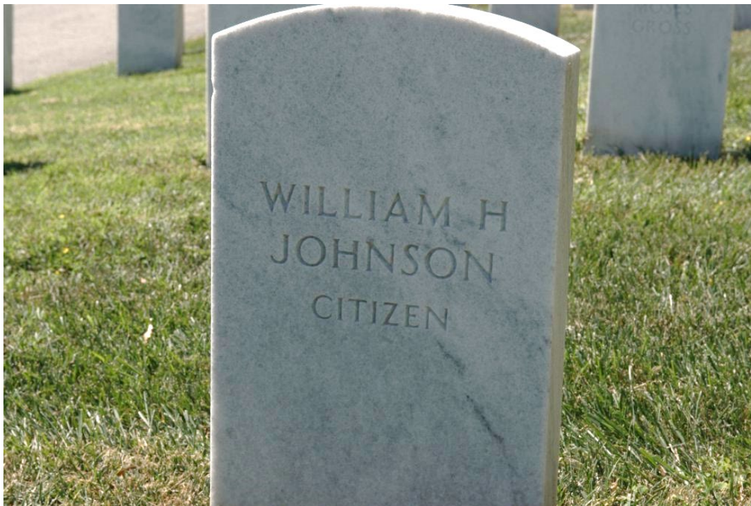
A headstone in Arlington National Cemetery marked “citizen.”

To understand who these people were and why they were buried in Arlington National Cemetery, we need to look back at the federal government’s role in assisting former slaves after the Civil War.