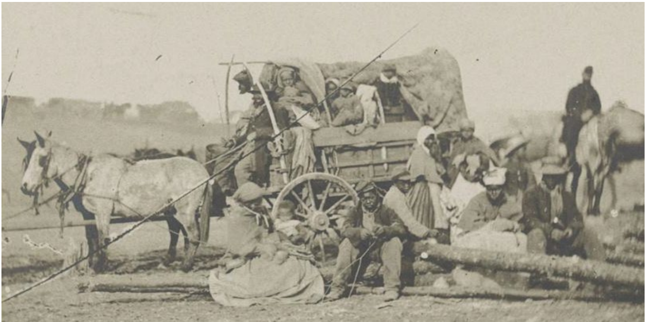
1863 photo of an African American family coming into U.S. Army lines.

In any war, “contraband” is the term for confiscated enemy property. During the Civil War, the United States also used the term “contraband” to refer to escaped slaves who fled across U.S. Army lines seeking freedom. This term dehumanized freedpeople, however, as it was the same language used for any other confiscated Confederate property, including livestock, machinery and buildings.