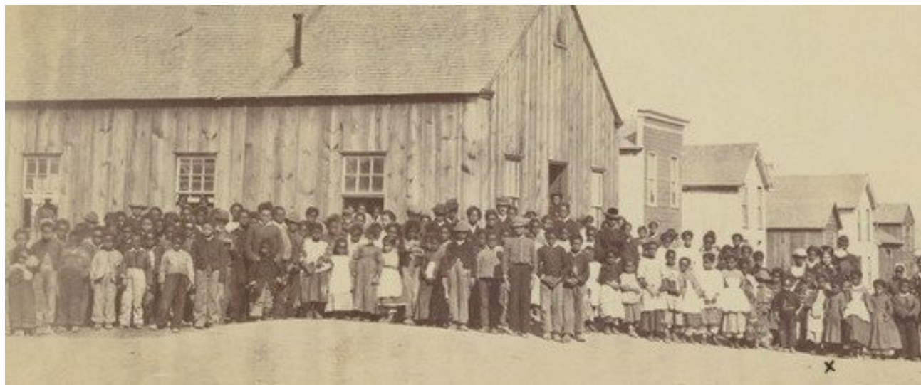
1864 photo of African American students and teachers outside their schoolhouse in Alexandria, VA. This school had been founded by Harriet Jacobs, a woman who escaped from slavery and published a book about her experiences in 1861. In the photo, she is marked with an X.