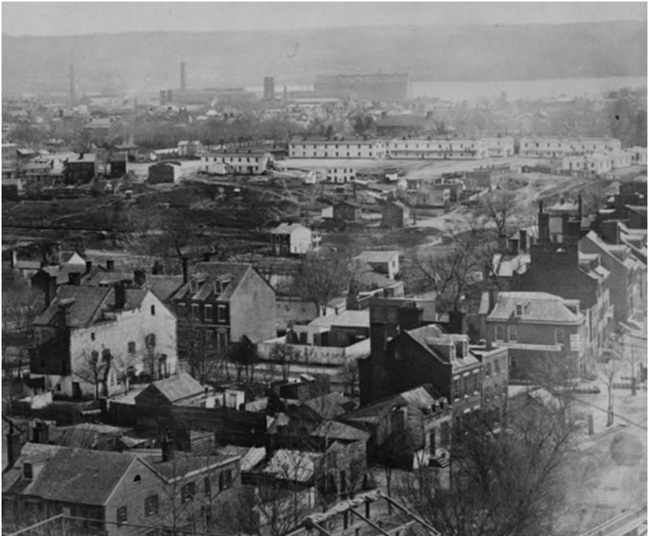
Washington, D.C., looking southeast from the Capitol building, 1863. (LOC)

Former Army barracks located in the square bounded by 6 th , 7 th , O and P Streets, NW, converted into tenement housing for freedpeople from 1866 to 1868.