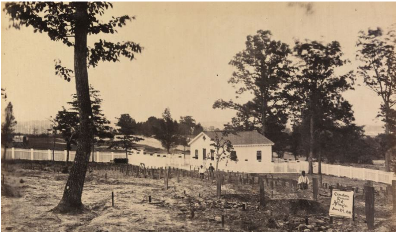
Photo taken June 29, 1864 of the first graves in Arlington National Cemetery.

In August 1864, Union Quartermaster General Montgomery C. Meigs ordered that Union soldiers and officers should be buried closer to Arlington House, and at that point, the military stopped burying white Union soldiers in Section 27. Burials of African American soldiers and civilians continued, however, and the section came to be known as the "Contraband Cemetery." From 1864 to 1867, more than 3,000 African American civilians were buried in Section 27, significantly outnumbering the number of soldiers (both white and Black) buried there.